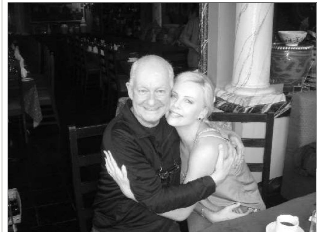
With Charlize Theron in Johannesburg to discuss their visit to KZN to entertain school children about social problems