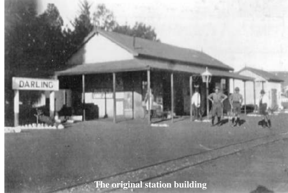
The original station building