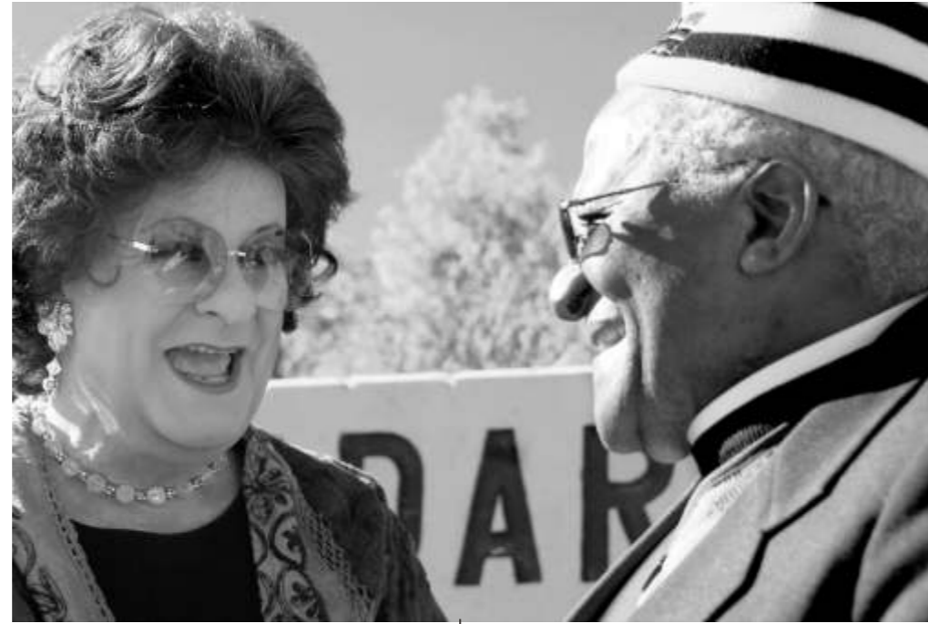
Tannie Evita and Archbishop Desmond Tutu on his visit to bless the Darling Community Pool and Education Centre.

Monthly debit orders are a vital form of