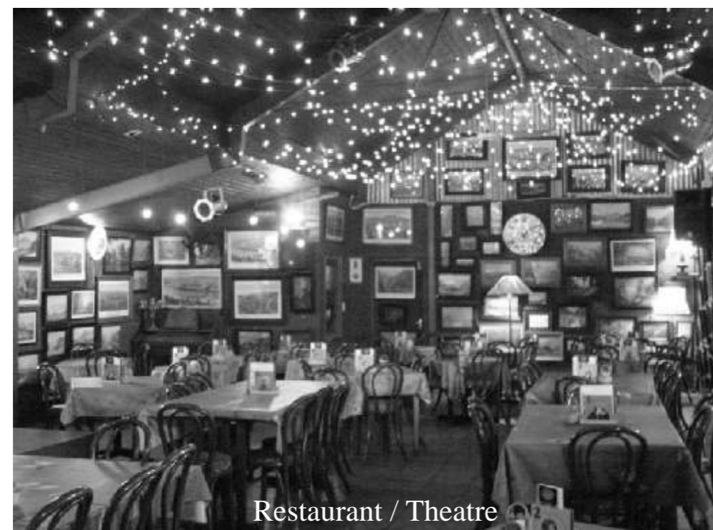
Restaurant / Theatre