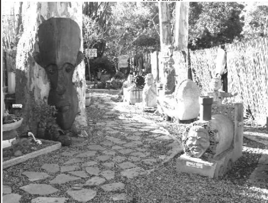
The Gravy Train sculpture in Boerassic Park - Madiba is the engine

Opposite this remarkable joyride is a Groot Trek Monument created by students from Stellenbosch University. The concrete ox wagon is bogged down in the mud of the past with four great stone oxen struggling to get out of the quicksands of history, buried to their heads while trying to wedge themselves and their heavy load through the golden arches of the MacDonald sign to the future.