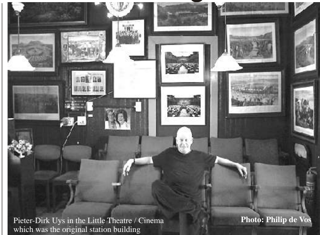
Pieter-Dirk Uys in the Little Theatre / Cinema which was the original station building