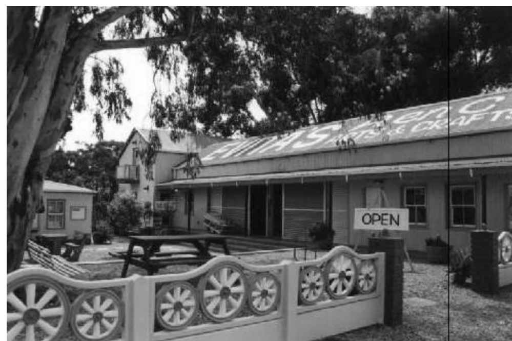
made them very shy.

De Kleine Post remained an outpost of the Company until 1791. When it was on the verge of bankruptcy, the Post was abolished and the cattle sold, but it remained government property and was leased out. It eventually was called Mamre. Many of the farms in the area also belonged to the Company and although a few were sold, most passed into the possession of the British when they took over the Cape.