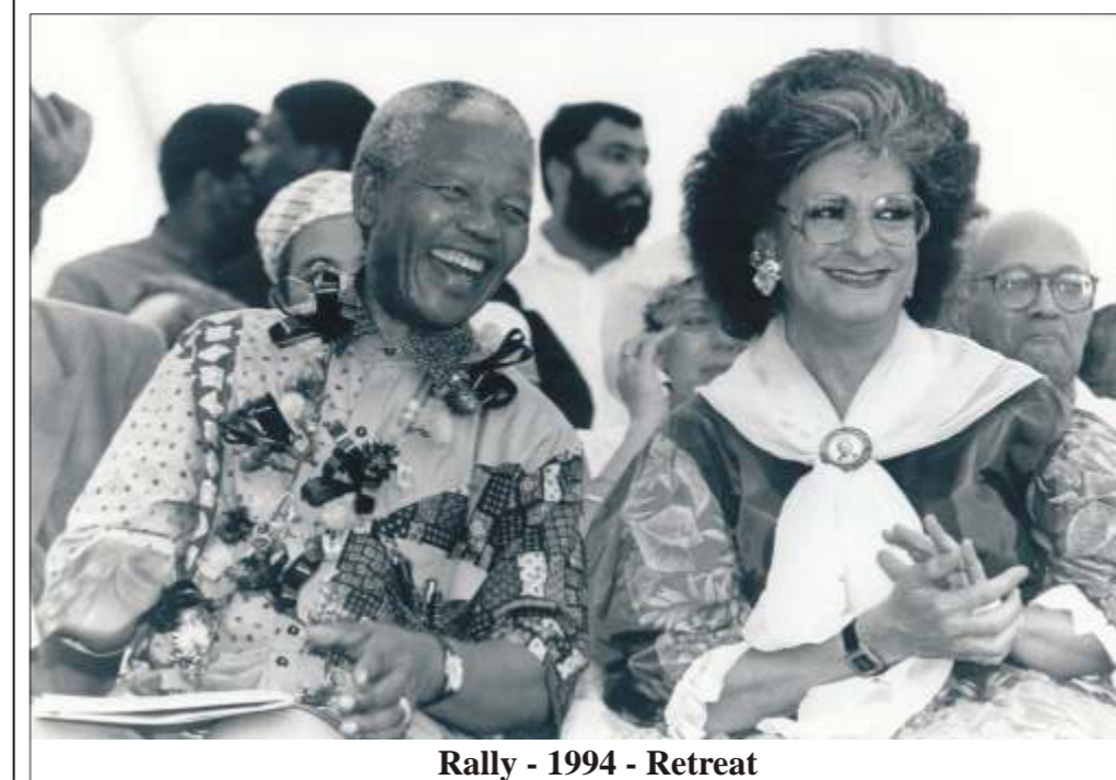
Rally - 1994 - Retreat

To book for shows phone Beryl - Tel 022 492 3930 email: bookings@evita.co.za - website: www.evita.co.za