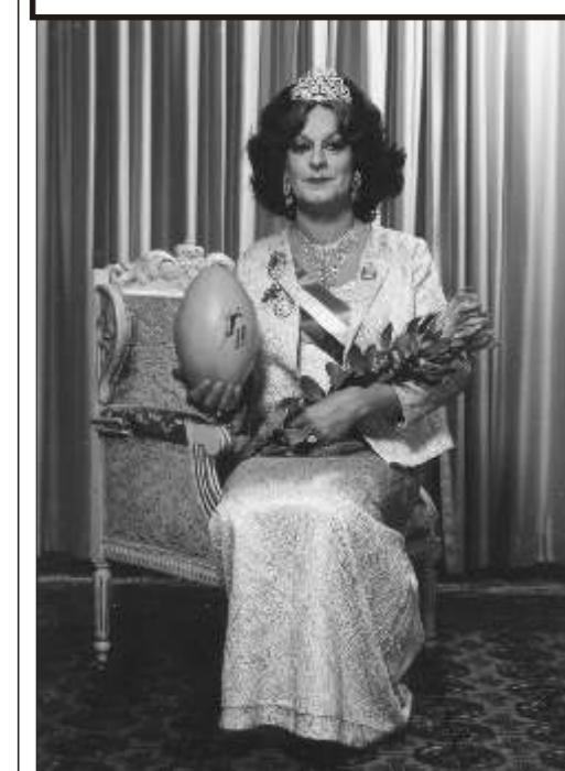
The former South African Ambassador to the Independent Homeland Republic of Bapetikosweti holding her symbols of state - a rugby ball and a protea. (1981-1993)

For accommodation and other sights and happenings in Darling... Phone Darling Tourism 022 492 3361 www.darlingtourism.co.za