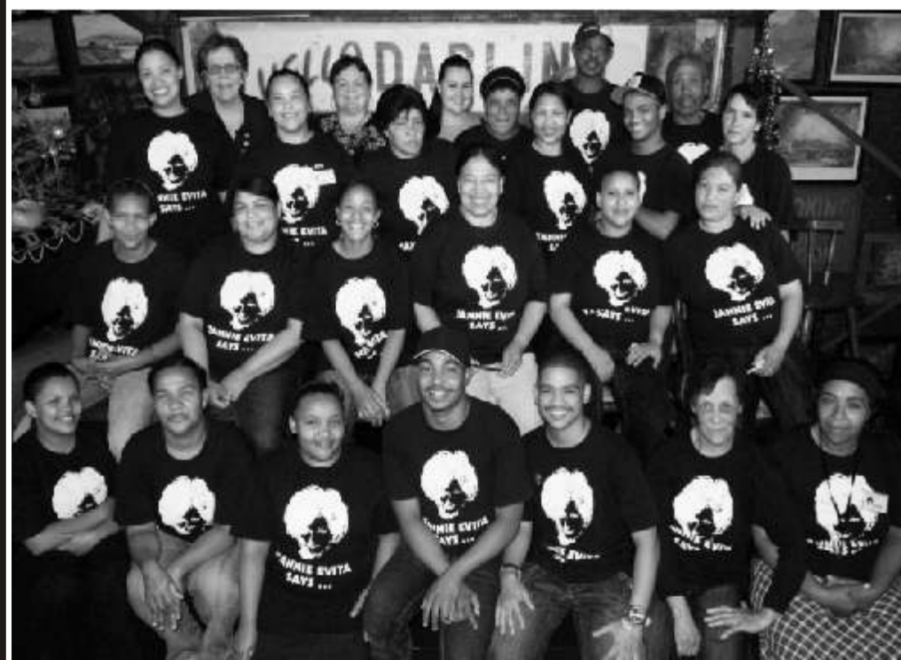
and our friendly staff at Evita se Perron